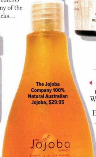
The Jojoba Company 100% Natural Australian Jojoba, $29.95