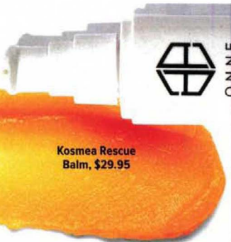
Kosmea Rescue Balm, $29.95