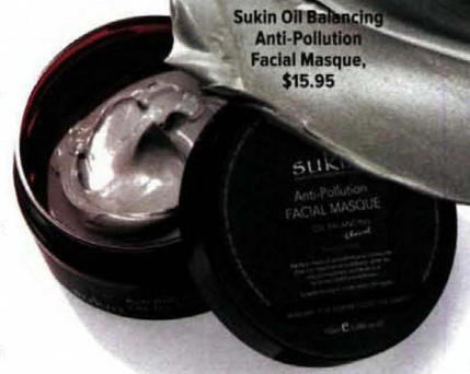
Sukin Oil Balancing Anti-Pollution Facial Masque, $15.95