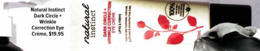
Natural Instinct Dark Circle + Wrinkle Correction Eye Crème, $19.95