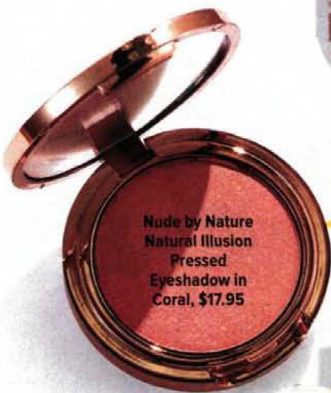
Nude by Nature Natural Illusion Pressed Eyeshadow in Coral, $17.95