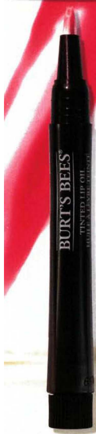
Burt's Bees Tinted Lip Oil in Whispering Orchid, $16.95 (available from March)