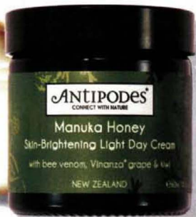
Antipodes Maunka Honey Skin-Brightening Light Day Cream, $59.95