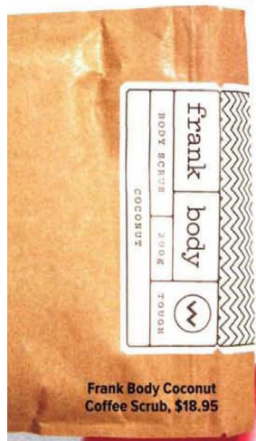
Frank Body Coconut Coffee Scrub, $18.95